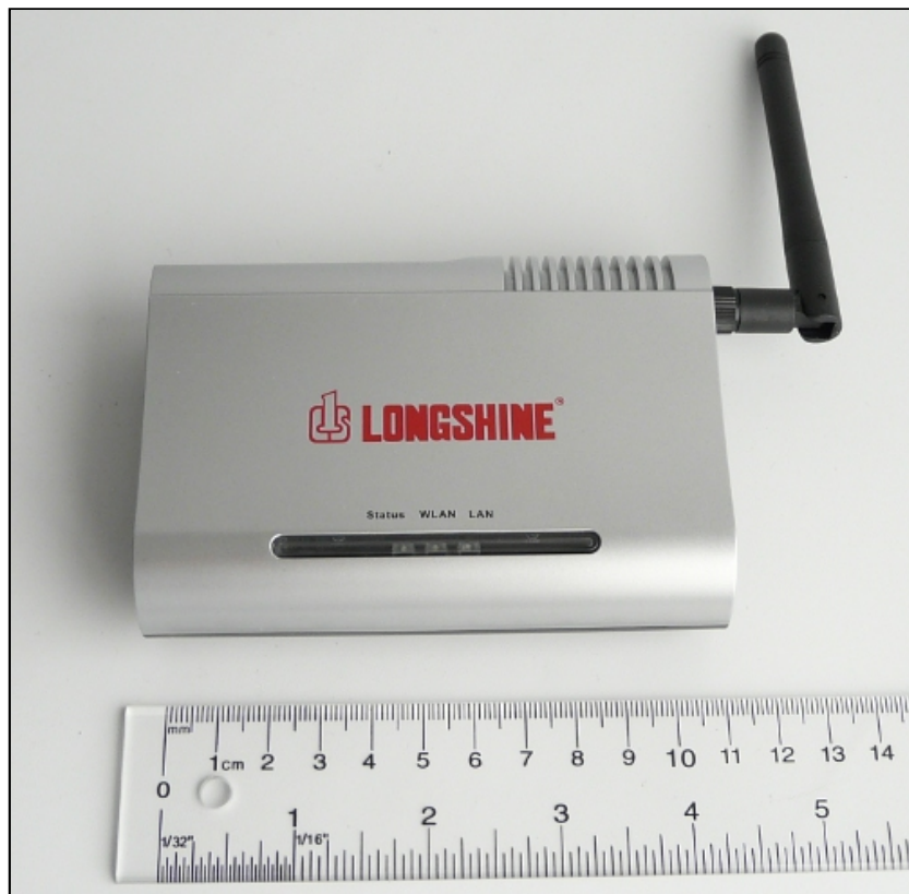
Longshine WA-45, works very well.

Here is how they look like. Most of them work very well.