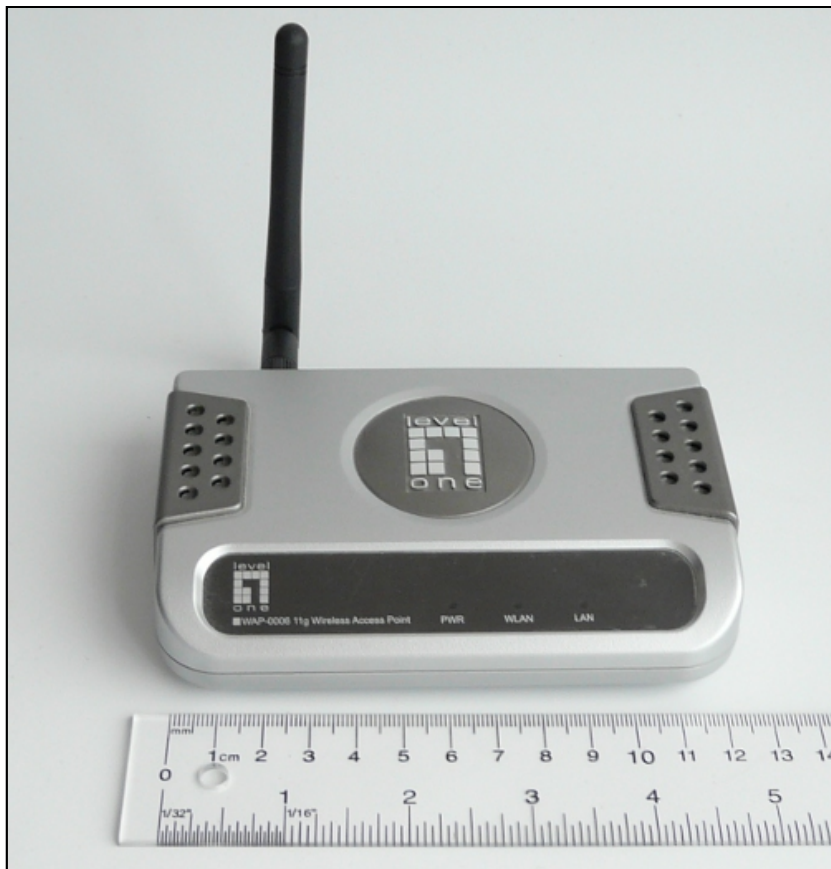
Level 1 wap0006, works very well.

A product to avoid is the D-LINK DWL-2100A. It can not be used to connect a server to a WiFi network as it does not handle initial Ethernet ARP broadcasts correctly.